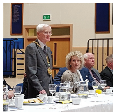
Lord Provost Ian Borthwick addresses the guests