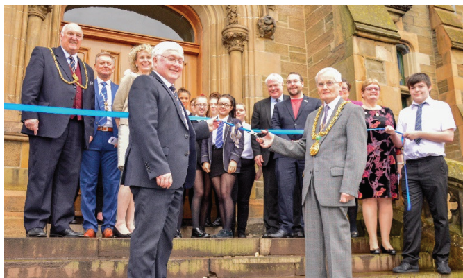
Ceremonial Ribbon cutting with top table guests, school pupils and members of the MAFPA committee.