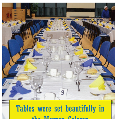
Tables were set beautifully in the Morgan Colours